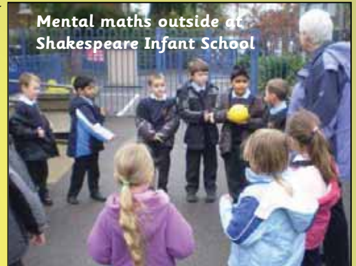
Mental maths outside at Shakespeare Infant School