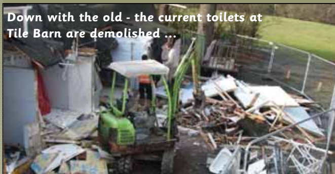
Down with the old - the current toilets at Tile Barn are demolished ...

Plans are now in place for the new toilet / shower block at Tile Barn (right) and permission has been given for building work to begin. This began in February 2011 and should be complete by the early summer. We do apologise for any impact of groups whilst the work takes place - temporary facilities will be in place until the new building is complete. The brand new building will be in the same place as the existing block and include individual; shower/changing cubicles, toilets, sinks, accessible & group leader facilities and an undercover D of E washing up area.