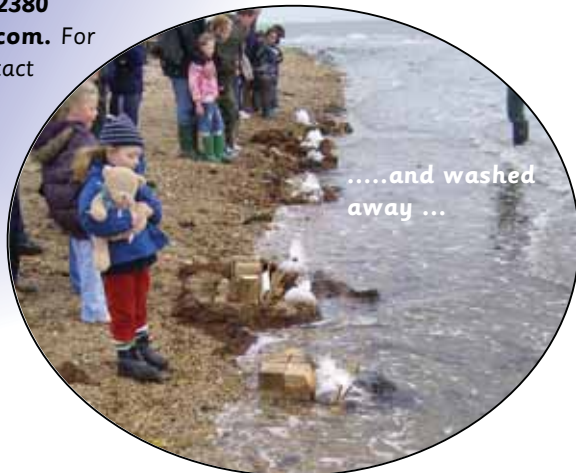
.....and washed away ...