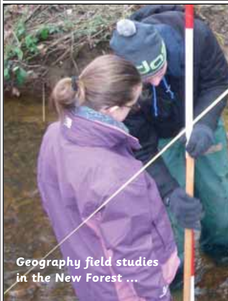
Geography field studies in the New Forest ...

Each student completed a full day River Study investigating the changes in geomorphology from the source to the mouth. Following which the students decided how to best present their data to the rest of the group, this included drawing accurate cross sectional profiles of the river channel. The students really rose to the challenge, and some excellent graphical work was completed as well as brilliant explanations of why the river changes as it does.