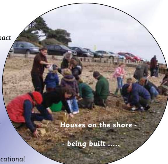
Houses on the shore - - being built ....