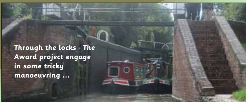
Through the locks - The Award project engage in some tricky manoeuvring ...

During the summer holidays, and as part of an ongoing 'Skills for Life' programme, the Award Project took a group of 6 young people to Braunston to spend a weekend on a Canal boat. The residential was aimed at providing the group with a new experience alongside the opportunity to put into action independent living skills. The young people took charge of the weekend by working up rotas of who would cook and clean and even did the shopping for the weekend before arriving at the canal boat.