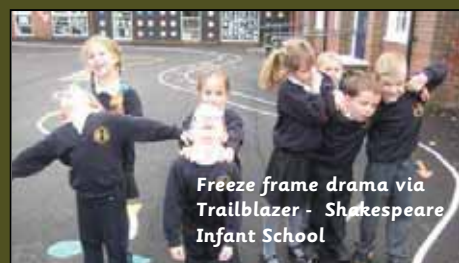
Freeze frame drama via Trailblazer - Shakespeare Infant School