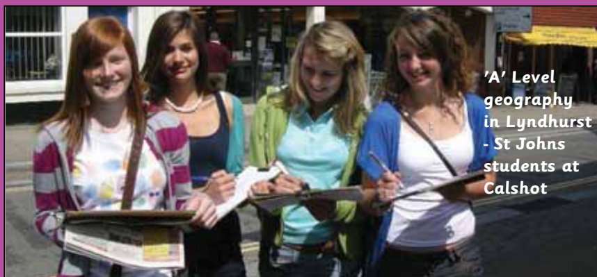
'A' Level geography in Lyndhurst - St Johns students at Calshot

The geography department of St. John's College , Southsea, has developed strong links with Calshot's Field Studies Department over many years. Groups from Year Seven to Year Thirteen have enjoyed the benefits of fieldwork in the New Forest and coastline covering a wide range of activities with the specialist teachers at the Centre.