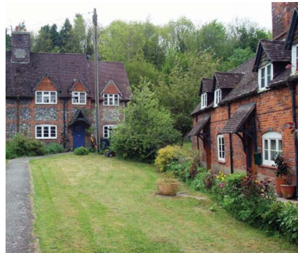
▲ Mill cottages in Laverstoke Lane