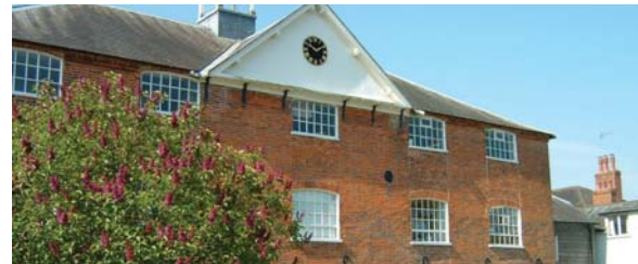
▲ Whitchurch Silk Mill