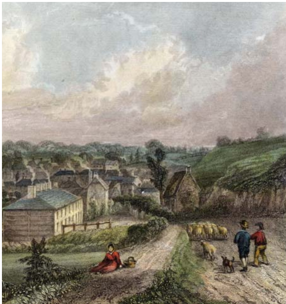
▲ Whitchurch in the Regency Era

Here at the Western End the Mill Trail creates a mini-circuit. (see Map). Leaving the Silk Mill, walk along the road, away from the town centre until you reach a road named The Weir. Take this road, then at the old Fulling Mill, turn in front to follow the riverbank path to the Church, then along Church Street to the town centre. Then you can either return back here, or else continue back uphill to the Rail station; or even carry on following the waymarks along the rest of the Mill Trail