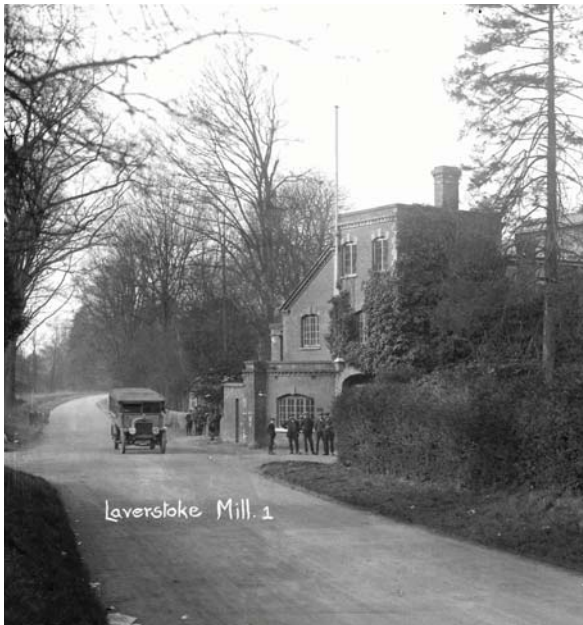
▲ Laverstoke Mill, circa 1920's

The hamlet of Laverstoke grew up around the Laverstoke paper mill, which was founded in the 15th century. The existing mill building dates from 1719 and became of national significance since it supplied the paper for the banknotes of the Bank of England. One could almost state the Portal family became rich by making banknotes! Sadly today the mill is defunct and it is planned to be converted into residential use.