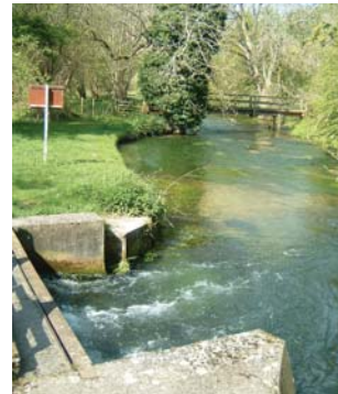
▲ The River Test

This is rather an oddity; a thatched terrace of eighteen estate workers cottages, which fronts the main road. It was architect designed as recently as 1939 and is certainly one of the longest, impressively thatched, buildings in England. However, its striking frontage contrasts with a rear view that is more utilitarian.