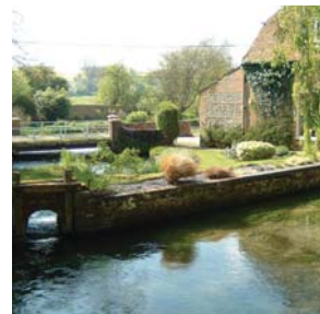
▲ The River Test at the Old Fulling Mill

As well as manufacturing silk, the Silk Mill encourages visitors and schools. It opens at 10.30am from Tuesdays to Sundays.