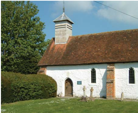
▲ St Nicholas Church, Freefolk

Services are held monthly and the church remains in use. It is cared for by the Churches Conservation Trust.