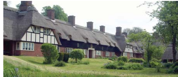
▲ Manor Cottages, the longest thatch in England?