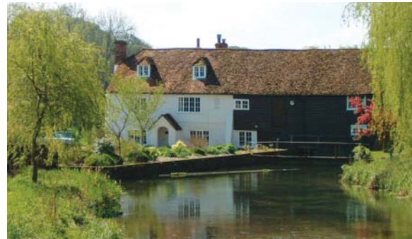
▲ Bere Mill. This and Laverstoke Mill were both paper mills owned from the early 18th Century by the Portal family. It is now a private house