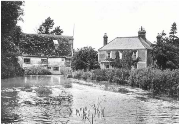
▲ Town Mill, circa 1950