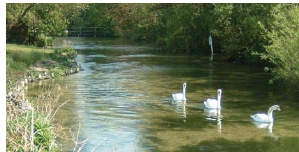
▲ The River Test

Alternatively, the Trail takes you east to Laverstoke and Freefolk and back. This 3 mile circuit, crosses and re-crosses the River Test by footbridges, and passes two more mills and the charming church of St Nicholas at Freefolk.