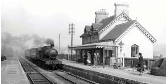
▲ Whitchurch railway station circa 1940's