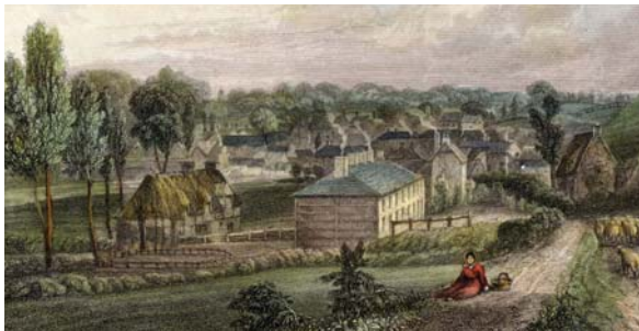
▲ Whitchurch in the Regency era, (Hampshire Record Office)

Whitchurch is a mill town. Once a working mill was located along the River Test every half mile through the town. Today all but one of the mills have been converted into private houses. This picture was painted at a time when water power in Whitchurch was nearing its peak of industrial production.